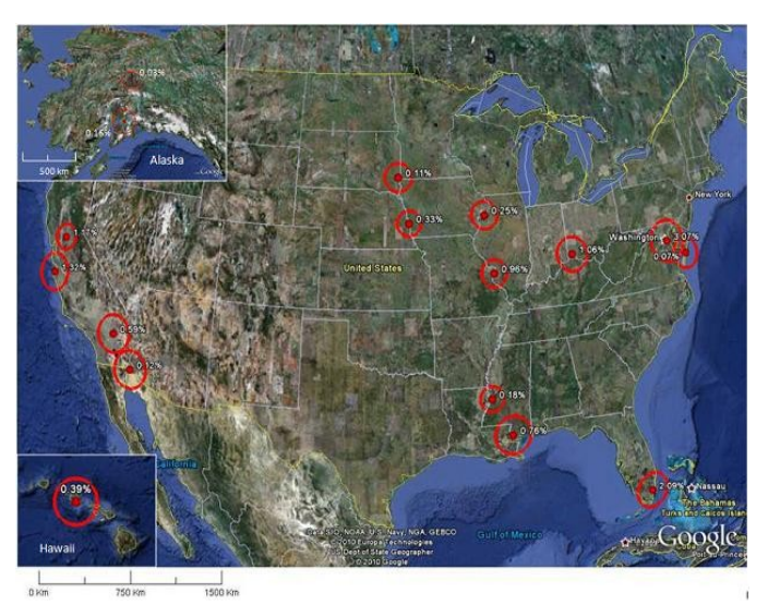
Figure 1 - Proposed Exclusion Zones

Ex ante enforcement works by attempting to prevent interference. One such approach is use of exclusion zones. In this approach, the PUs and SUs would agree on a spatial database that defines these exclusion zones. In its initial submissions, NTIA proposed exclusion zones with a radius in the 72 - 121 km range (See Figure 1).